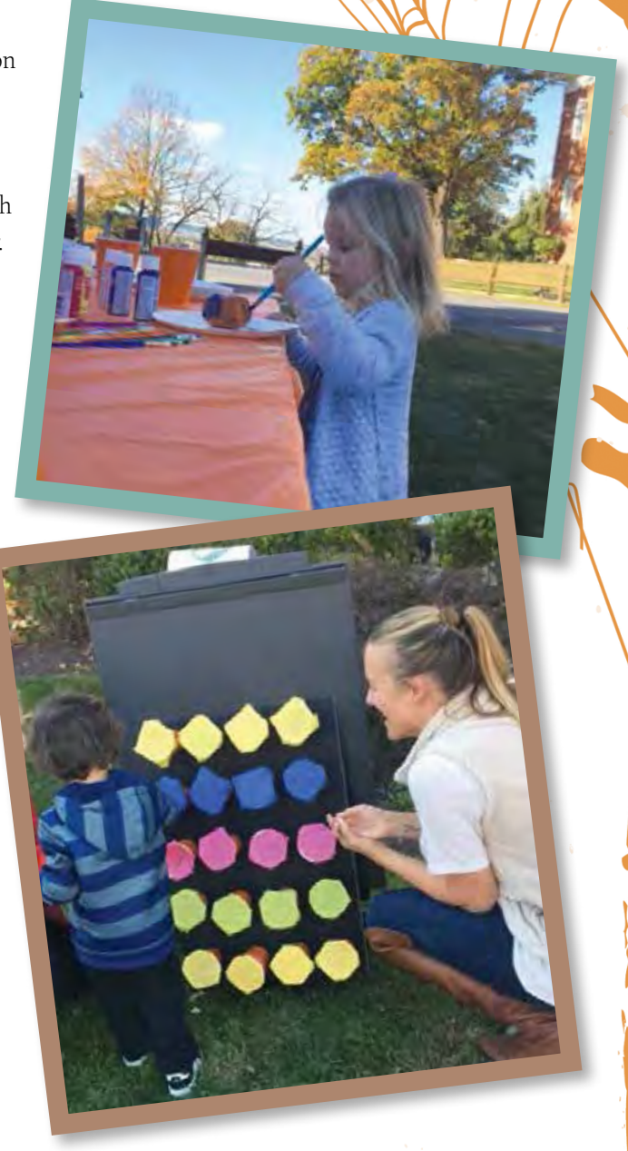
Halloween fun brought foster families together to share time with one another.